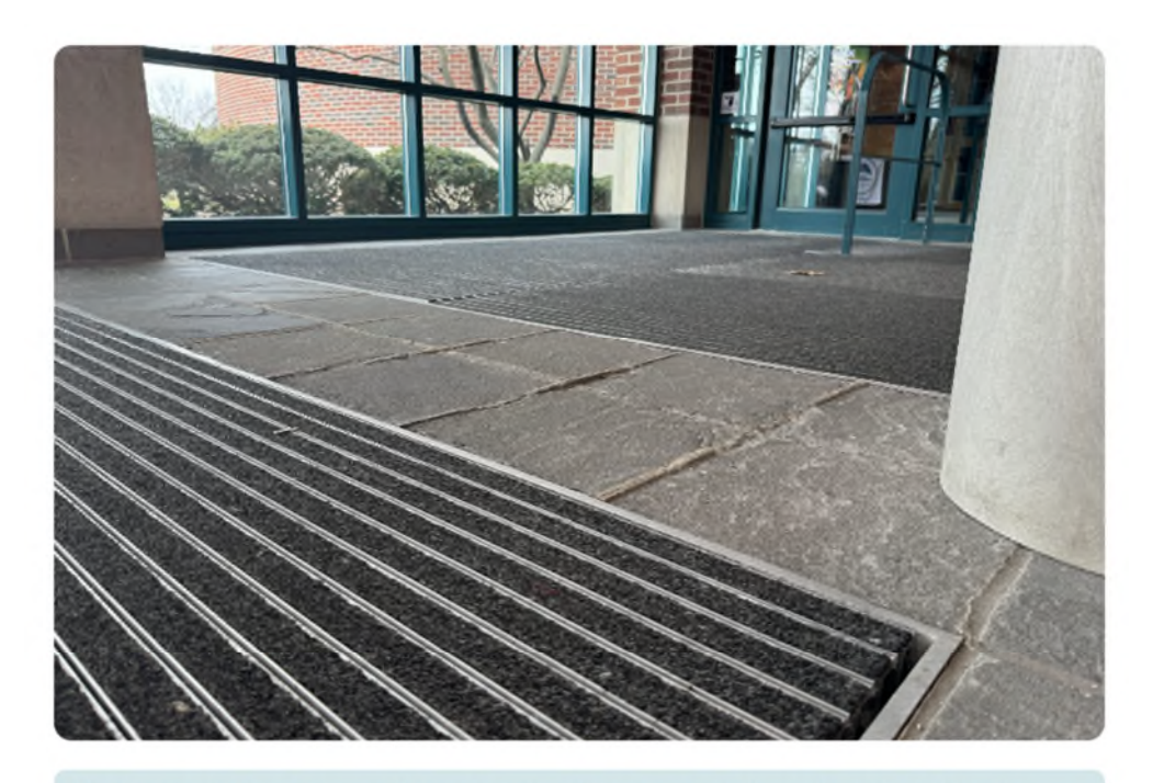
The library building is over 30 years old and needs crucial repairs and updates to meet ADA compliance and modernization.